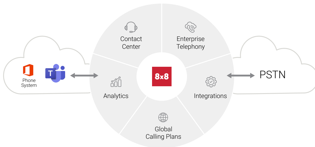
Figure 1 The 8x8 Business Phone integration, including 8x8 service portfolio for Microsoft Teams

Unlike other vendors, 8x8 allows your Teams users to make and receive calls without altering their user experience in any way and by continuing to use the same Teams apps, whether they are web, desktop or mobile. The integration is simple: customers select licensing bundles from Microsoft and 8x8 with just a few clicks, enabling Microsoft Teams for cloud telephony and dialing using the 8x8 cloud communications platform.