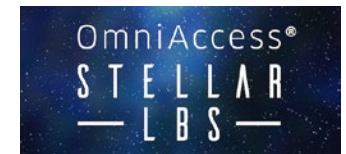
Examples of location-based service interfaces