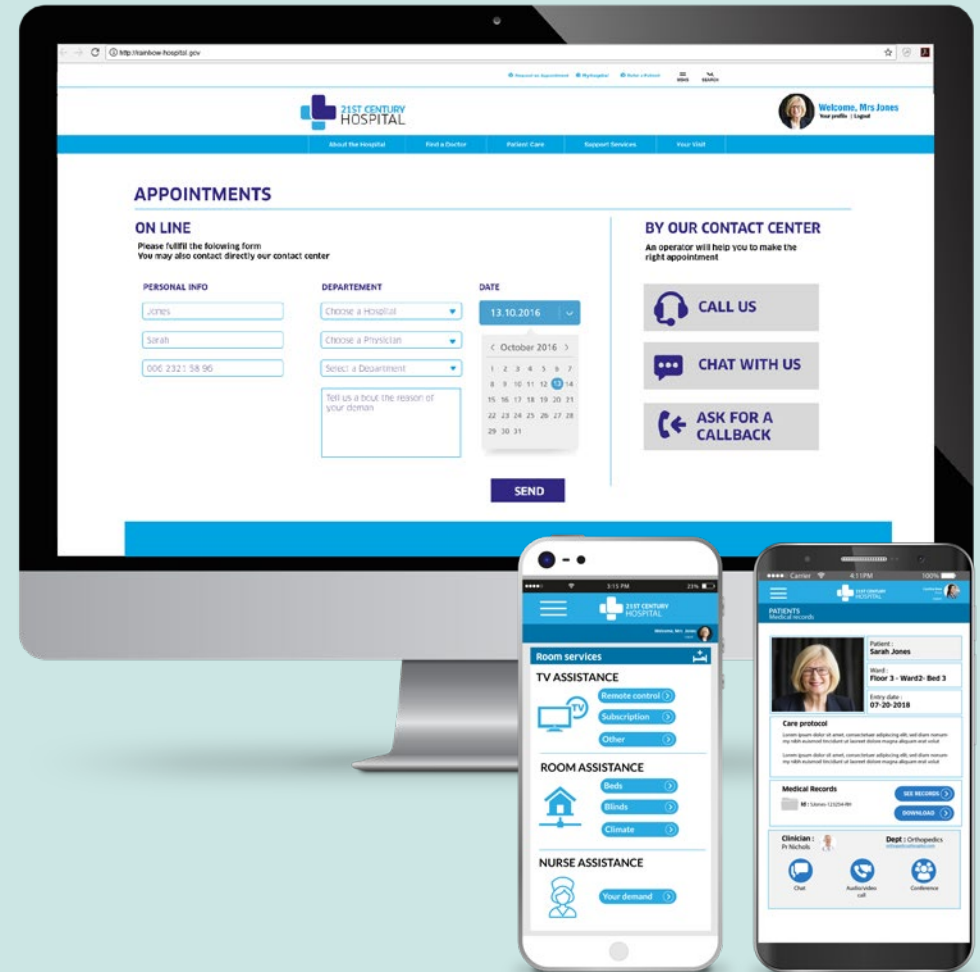
Examples of Rainbow interfaces for innovative patient services

Rainbow will allow the hospital to manage who is in contact with, or has access to, such data, taking into account the organization of the hospital and its interactions with the outside world and the process course stage. Rainbow HUB enables engagement and partnership with startups to provide integrated connectivity services in business applications. For example, the company Clepsydra has quickly integrated Rainbow APIs in its application (Sovinty) of perioperative monitoring.