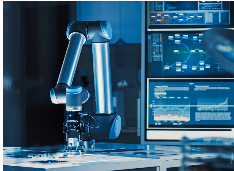
Figure 1 | Prowess Consulting evaluated how to streamline IT operations for an AI-driven inspection system

Finally, we compared Dell Technologies OEM licensing with Microsoft volume licensing to determine the right licensing strategy to streamline IT.