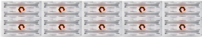
Figure 3. FlashBlade//S capacity range

Up to 19.2PB of Flash (Effective 2 : 25PB)