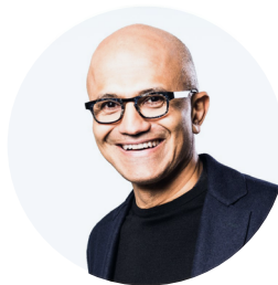
— Satya Nadella CEO, Microsoft

“[Accessibility] used to be a checklist of things you did after the product was built. This is about taking it way upstream to the design process, where you start up-front by thinking about inclusive design.”