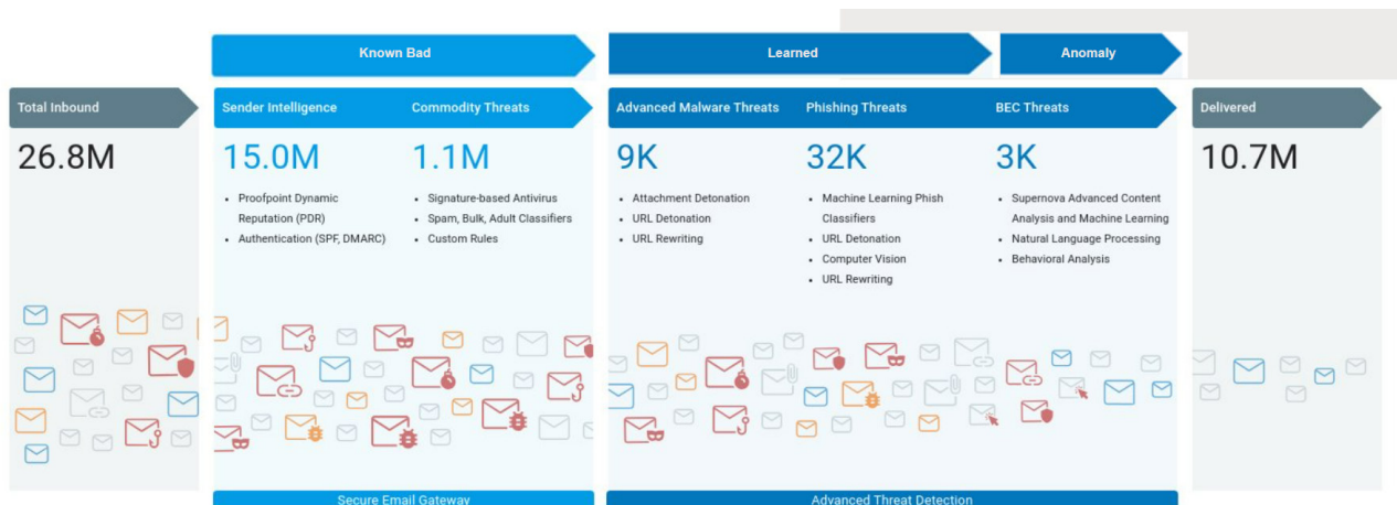
Figure 1. Proofpoint AI-driven, multilayered, pre-delivery detection in action.

We use a multilayered detection stack that is comprised of threat intelligence, machine learning, behavioral AI, sandbox detection, content and semantic analysis (LLMs). These work together to detect multiple types of modern threats. As a result, the stack delivers a high-fidelity detection rate of 99.99% with better threat explainability. And unlike single-layered detection email security solutions, it yields fewer false negatives and fewer false positives because it can more accurately stop malicious messages without blocking good messages and impeding your business.